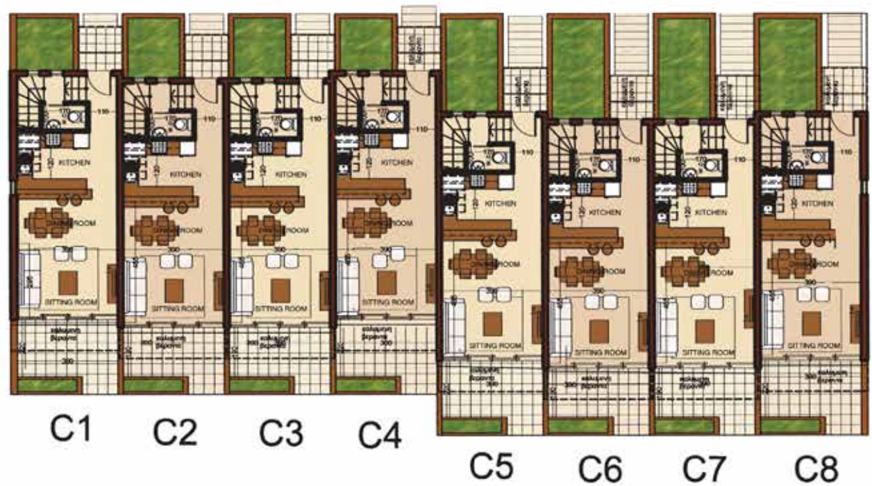
Block C - 1st Level