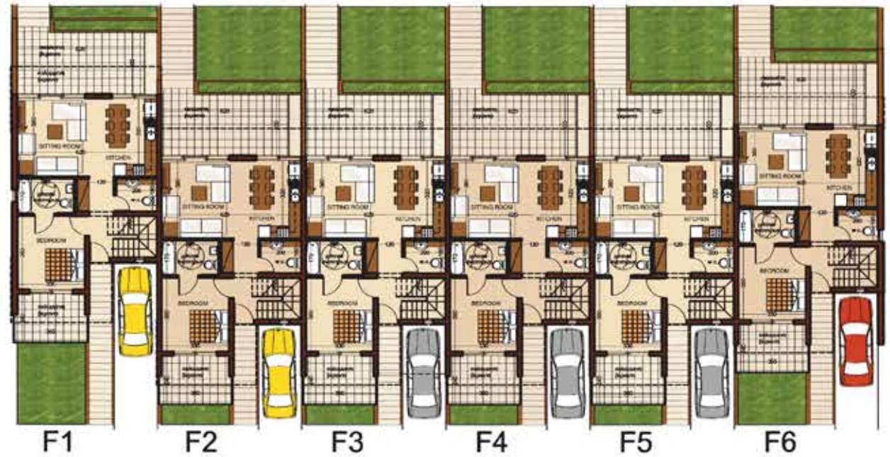
Block F - 1st Level