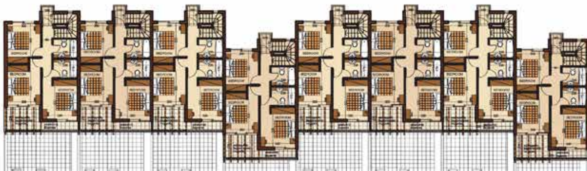
Block G - 3rd Level