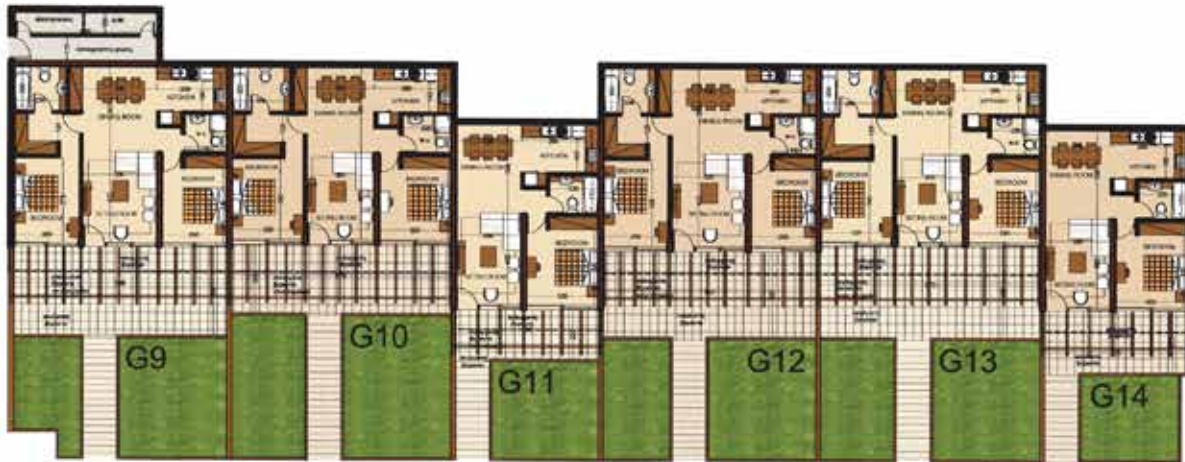
Block G - 1st Level