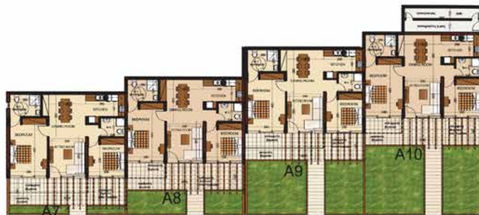
Block A - 1st Level