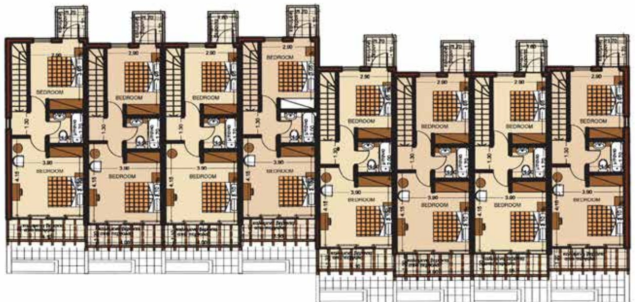
Block C - 2nd Level