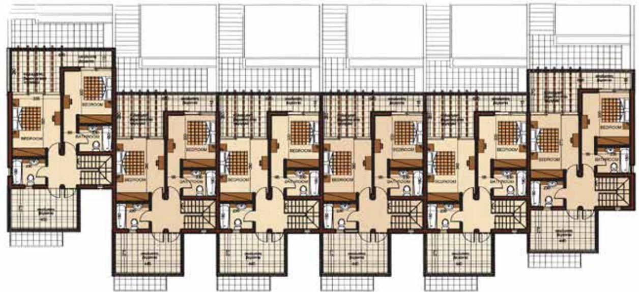
Block F - 2nd Level