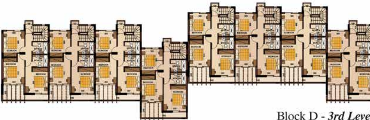
Block D - 3rd Level