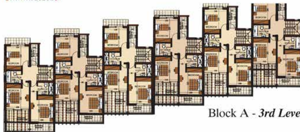
Block A - 3rd Level