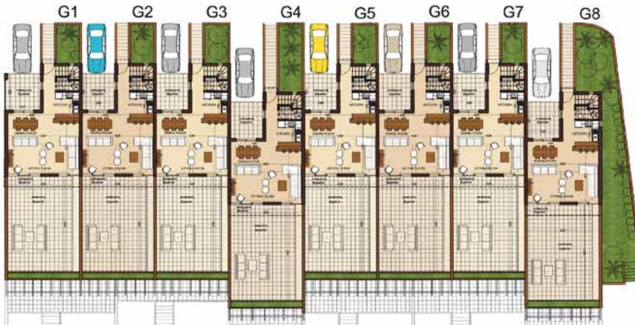
Block G - 2nd Level