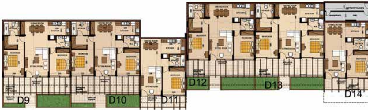
Block D - 1st Level