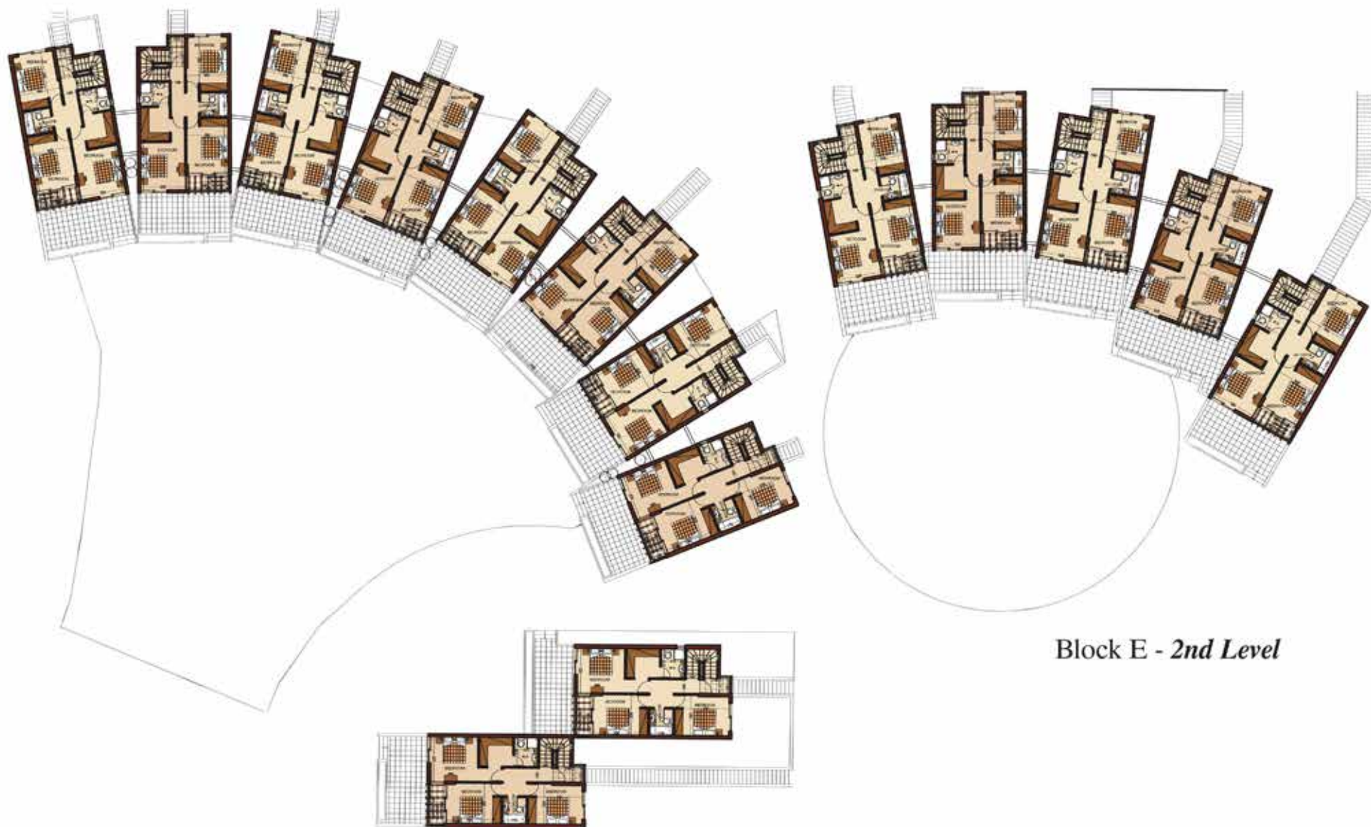
Block E - 2nd Level