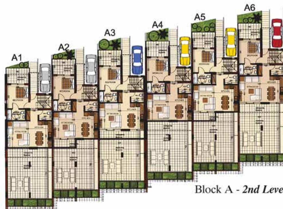
Block A - 2nd Level