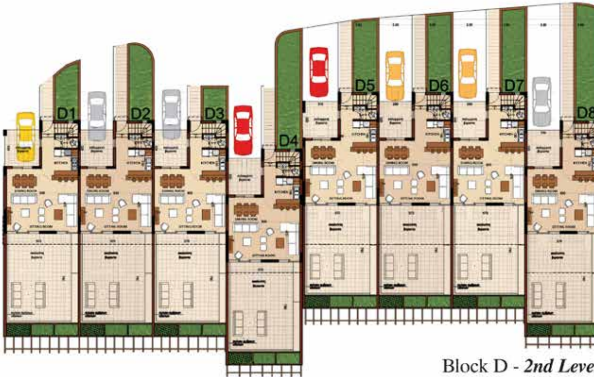
Block D - 2nd Level